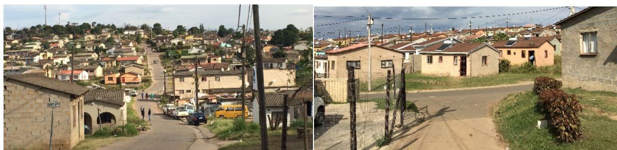
Case studies: Piesang River (L) and Namibia Stop 8 (R) in Durban

Across Africa, informal settlements struggle with poor housing, limited services and environmental hazards. Despite an increasing emphasis on participatory upgrading, communities are often constrained by lack of resources or technical knowledge to lead these processes, particularly when urban policies are designed and implemented without a clear understanding of local conditions. ISULabaNtu seeks to support communities by strengthening their capacity to guide urban development themselves. With a focus on Durban Metropolitan Area, South Africa, ISULabaNtu will undertake research, capacity building and community mapping, in collaboration with residents, to feed into the creation of an integrated environmental and construction management toolkit. The project will also explore how findings can be applied elsewhere. These activities will not only build the capacity of residents on community-led approaches to construction management and service provision, but also promote the creation of partnerships with other stakeholders such as local businesses, policy makers and academics.